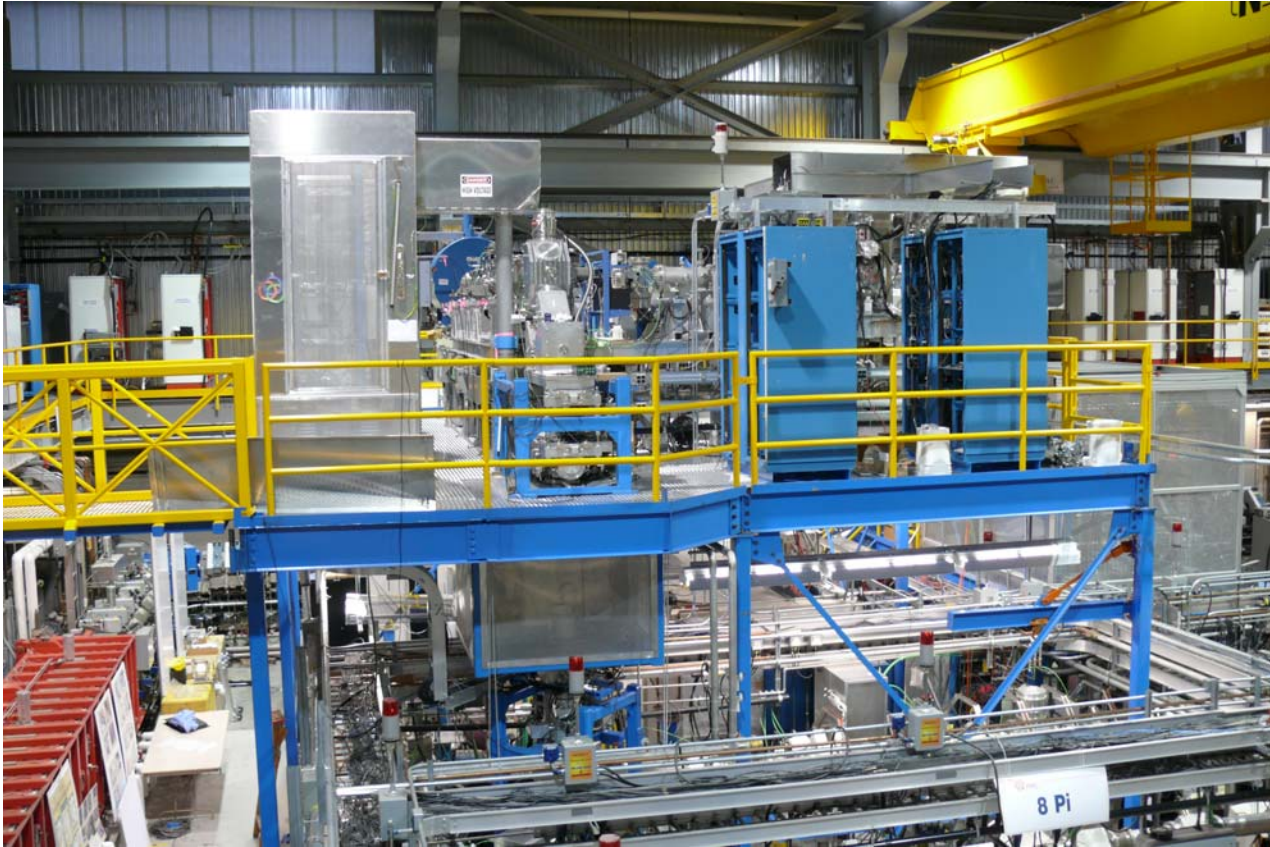
Figure 1: Picture of the TITAN platform. In the foreground one can see the vertical transfer beam line and the HV cage surrounding the RFQ cooler, in the background the circular shape of the MPET superconducting magnet. EBIT is behind the racks perpendicular to RFQ-MPET beamline.